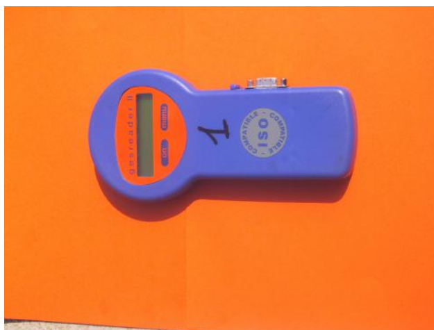
Figure 3. Handheld Reader.