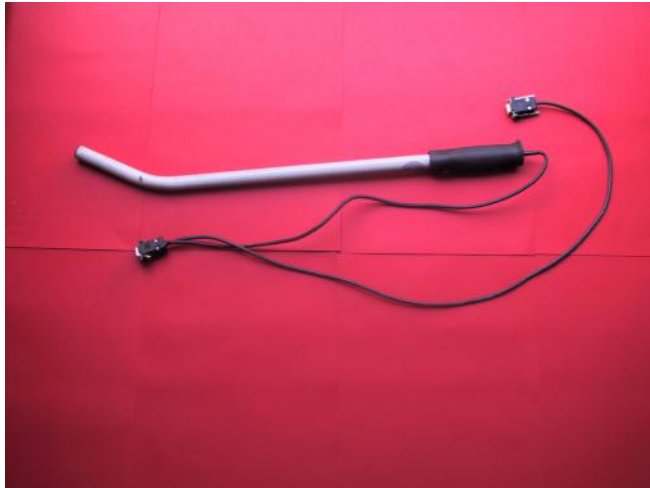
Figure 4. Stick Antenna.