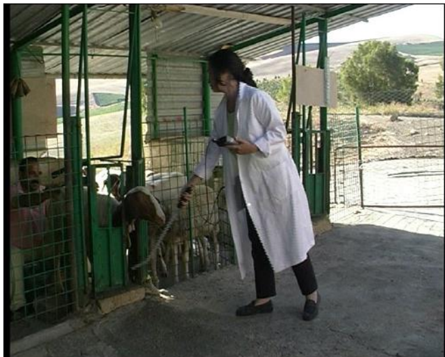
Figure 5. Reading animal identification in the field