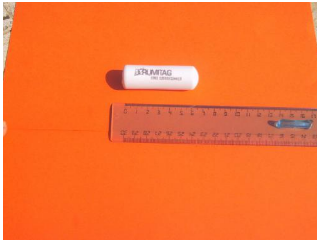
Figure 1. Rumen bolus microchip.