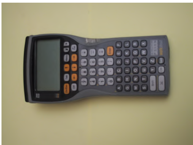
Figure 6. Records Keeper.