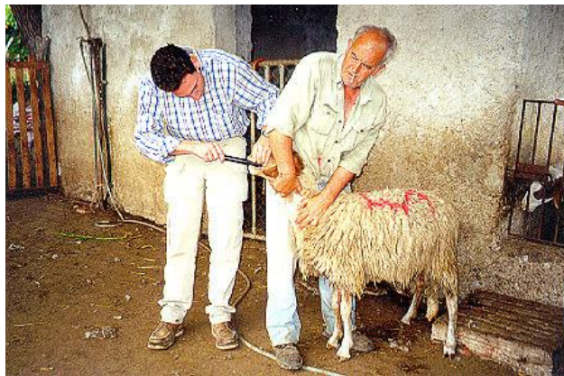
Figure 2. Ingestion of Rumen Bolus.